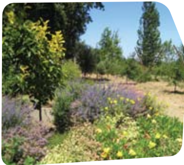
Filigreen Farm, a biodynamic farm, in Mendocino, California

If we take this statement seriously, then the current state of our food system certainly gives cause for alarm. Since Webster's time, agriculture has more and more come to resemble another branch of industrial manufacturing. The goal of most farming is simply to maximize the yield of food per acre, regardless of the social or environmental consequences. Output alone is the measure of success, and this is reflected in, and reinforced by, our wider consumer civilization. Many have come to demand more quality in greater quantity at ever lower prices. The qualities and requirements of production and labor are no longer visible or valued.