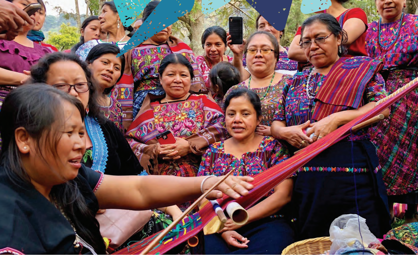
Photo: Participants at the Weaving Strength and Knowledge exchange program.