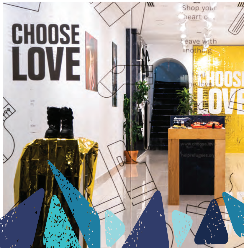
Photo: Choose Love/Help Refugees pop-up store.